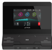
UNITE 10" TOUCHSCREEN