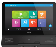
UNITE 22" TOUCHSCREEN