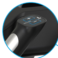
Easy-access quick-touch keys