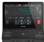
UNITE 16" TOUCHSCREEN