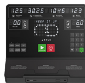
UNITE LED CONSOLE