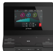
UNITE 10" TOUCHSCREEN