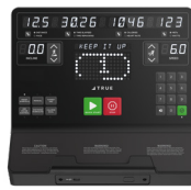
UNITE LED CONSOLE