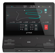
UNITE 16" TOUCHSCREEN