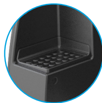
Rear steps provide user-friendly step-up assistance