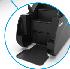
Optional Sweat Tray