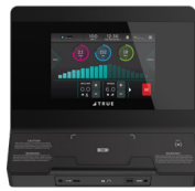
UNITE 10" TOUCHSCREEN