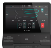
UNITE 16" TOUCHSCREEN