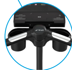
Bottle Holders on left and right