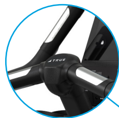
Multi-Position Handlebar design with Moisture-Resistant Sleeve

The Gravity Upright Bike combines premium materials with smart design. Paired with TRUE's renowned quality and durability, this bike is destined to become a favorite in your facility with both beginners and seasoned cyclists. Its compact footprint also enables you to optimize premium space in your facility.