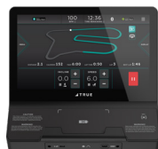
UNITE 16" TOUCHSCREEN