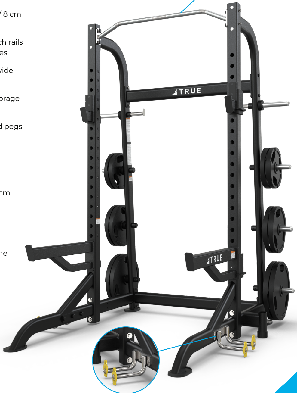
Available with optional band pegs