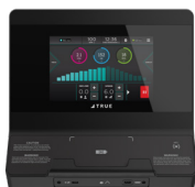
UNITE 10" TOUCHSCREEN