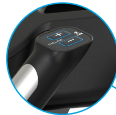
Easy-access quick-touch keys