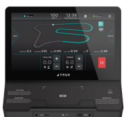
UNITE 16" TOUCHSCREEN