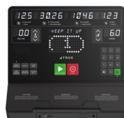
UNITE LED LED CONSOLE