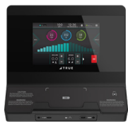
UNITE 10" TOUCHSCREEN