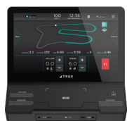
UNITE 16" TOUCHSCREEN