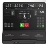
UNITE LED CONSOLE