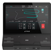
UNITE 16" TOUCHSCREEN