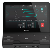
UNITE 16" TOUCHSCREEN