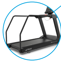
Optional Extended Handrails