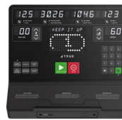
UNITE LED CONSOLE