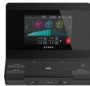
UNITE 10" TOUCHSCREEN