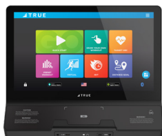
UNITE 22" TOUCHSCREEN