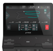
UNITE 16" TOUCHSCREEN