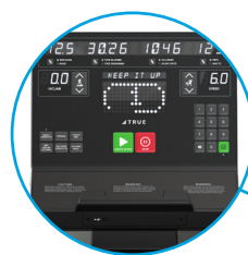
Multiple console options