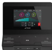
UNITE 10" TOUCHSCREEN