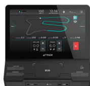
UNITE 16" TOUCHSCREEN