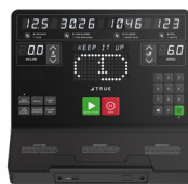
UNITE LED CONSOLE