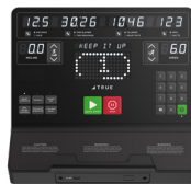
UNITE LED CONSOLE