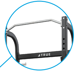
Chrome-plated, knurled, multi-position chin up bar