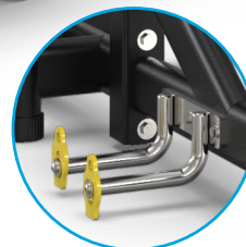
Available with optional band pegs